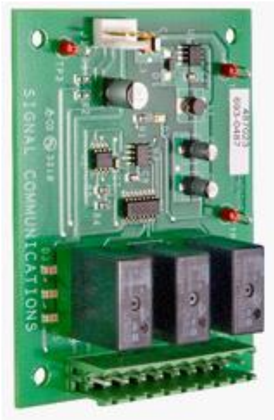
ZT-MNS-100BAS Interior Layout